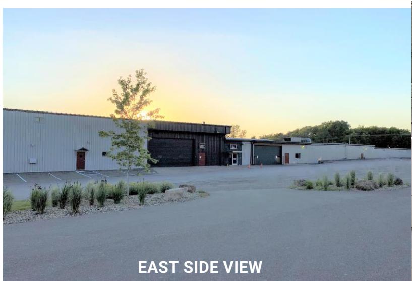
EAST SIDE VIEW