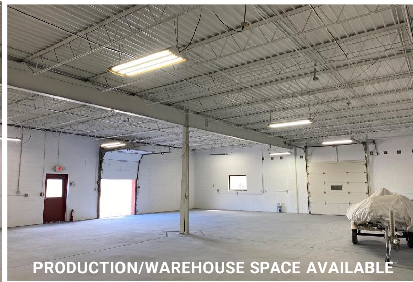
PRODUCTION/WAREHOUSE SPACE AVAILABLE