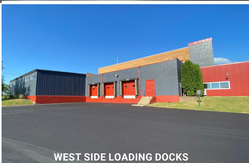
WEST SIDE LOADING DOCKS