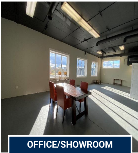
OFFICE/SHOWROOM 1 ST LEVEL

Baldwin East is a 12 ½ acre Commercial and Light Industrial Park located just a short distance from I-94 in Baldwin, Wisconsin. The property consists of the former Dairyland Power Building, which is a Multi-Tenant 40,000 SF Building, along with a 60,000 SF Multi-Tenant Office/Warehouse Building.