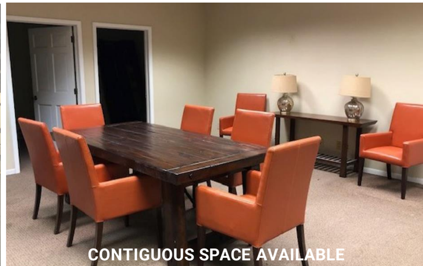
CONTIGUOUS SPACE AVAILABLE