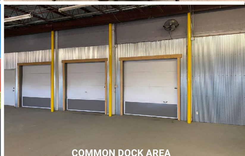
COMMON DOCK AREA