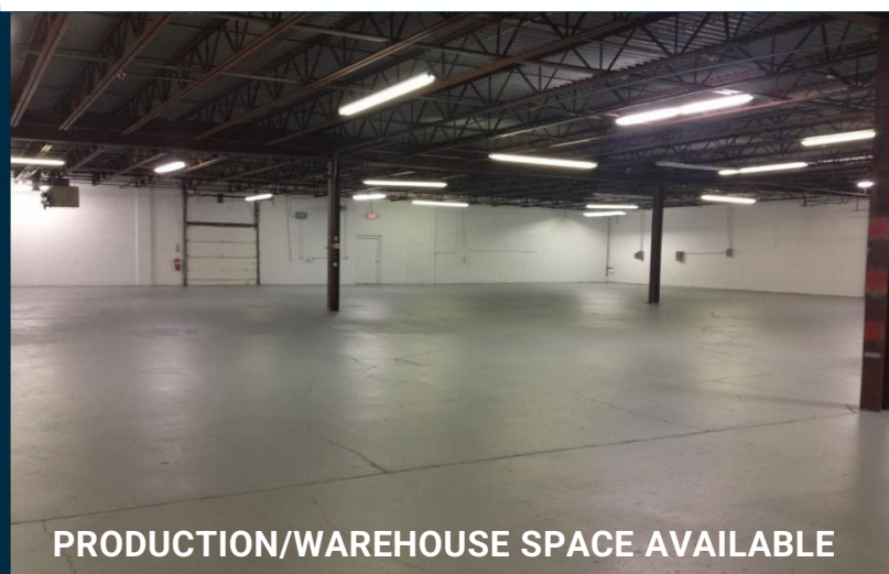
PRODUCTION/WAREHOUSE SPACE AVAILABLE