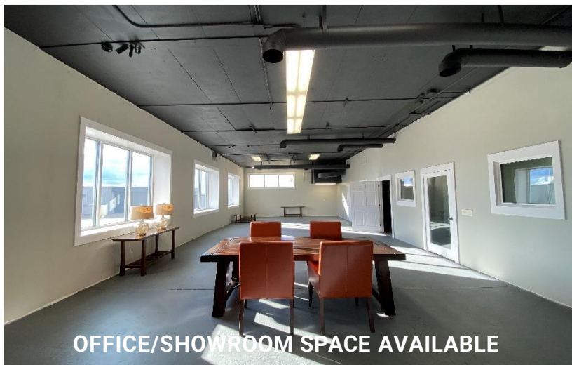
OFFICE/SHOWROOM SPACE AVAILABLE